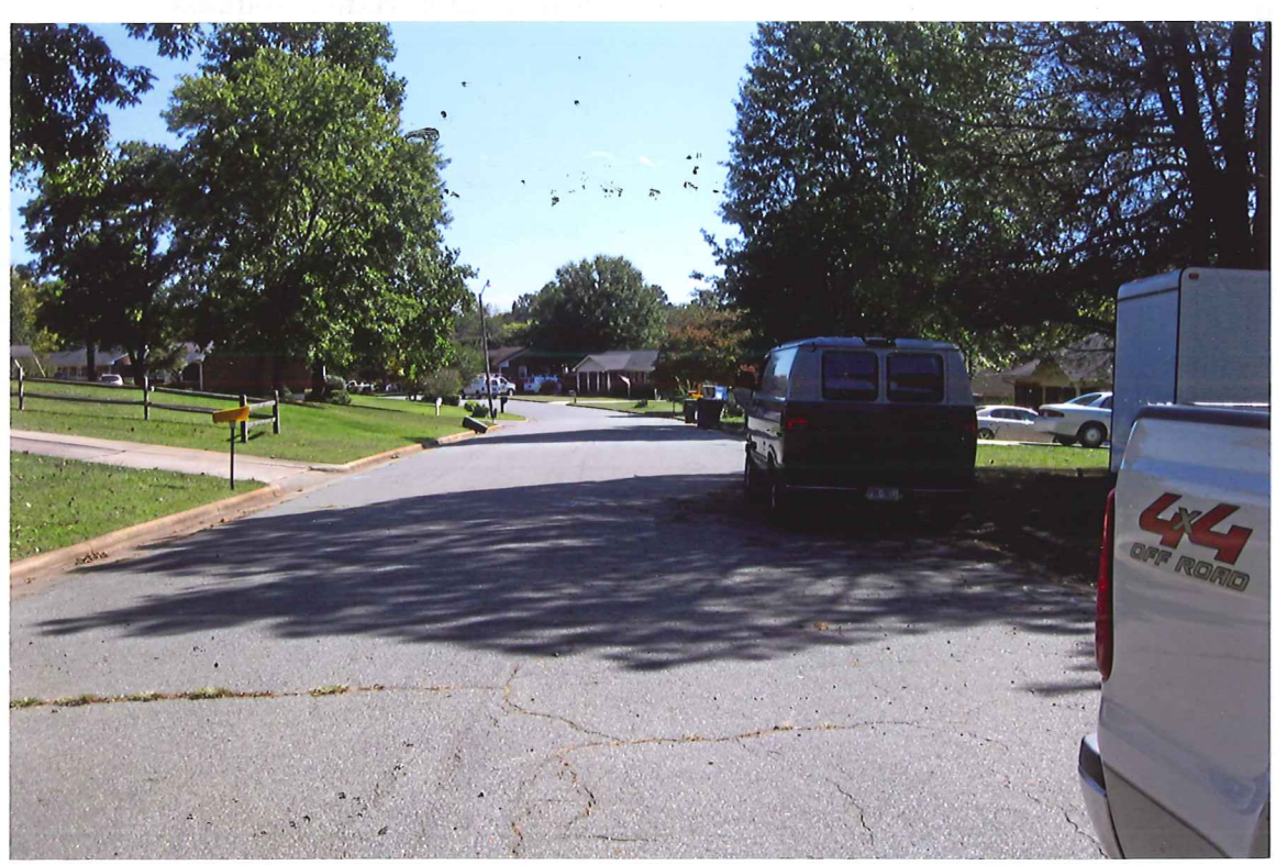
Down Essex Dr from house. This would create parking out of street when we have visitors.