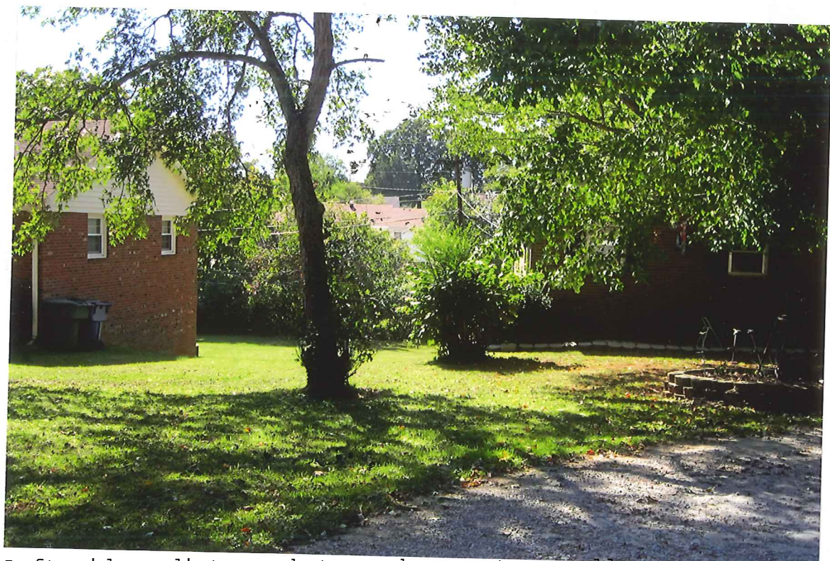
Left side - distance between houses too small