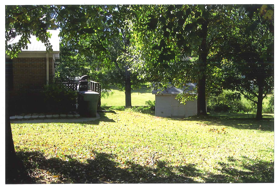
Right front of house