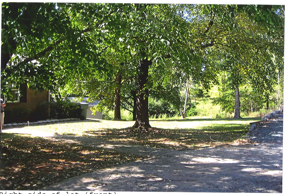
Right side of lot (front)