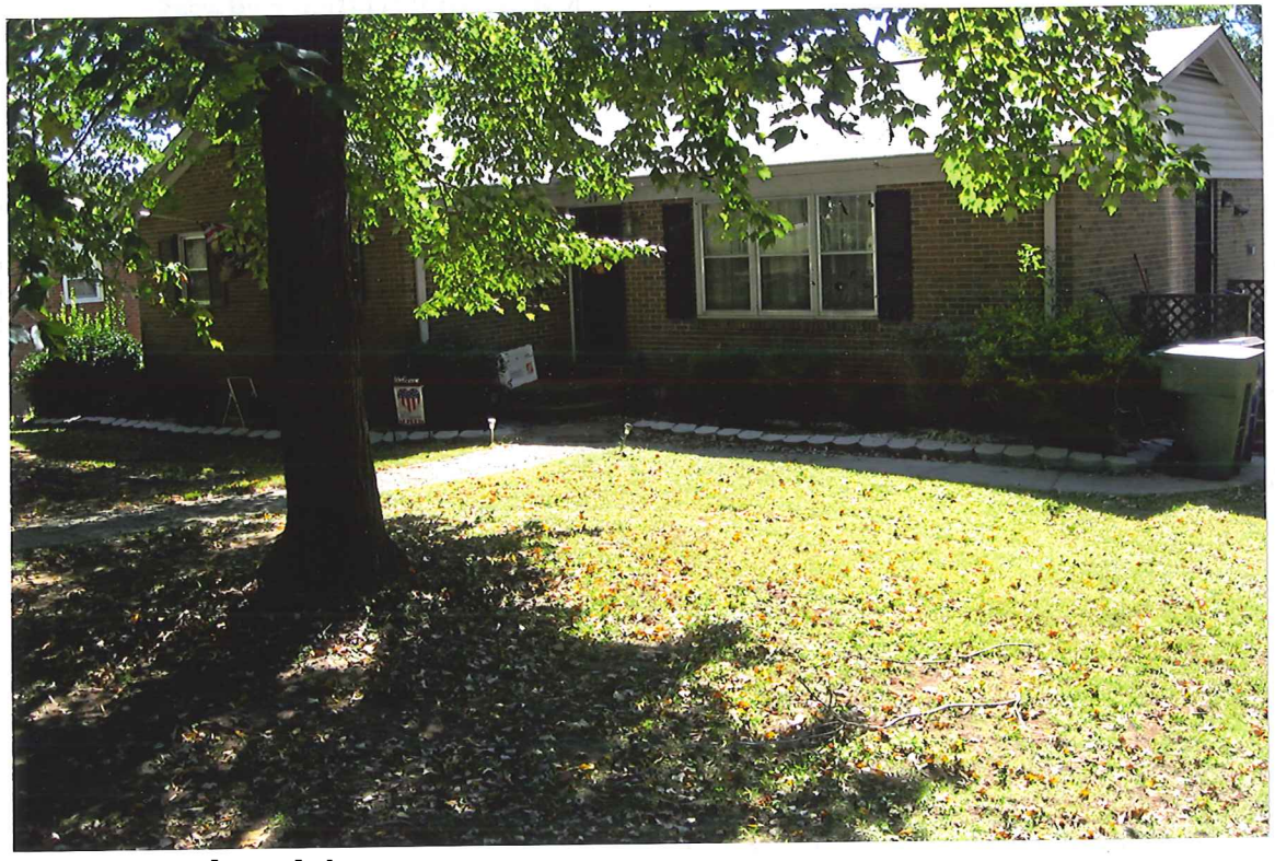
Front yard and house