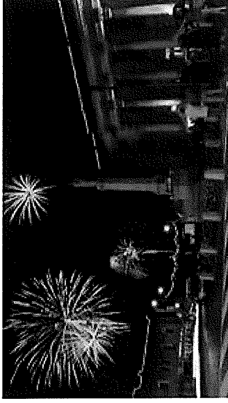
The Courthouse Square Historic District was designated as a local historic district in 1980 and was listed on the National Register of Historic Places in 1983.

What kind of standards will my exterior repairs/upgrades be held to? For example, will I still be able to afford to replace my windows with more energy-efficient ones? Part of the process of designating the area as a local historic district will be to decide what characteristics contribute to its historic character. Standards or guidelines for types of materials and other building components will be agreed upon as part of the designation process. As an example of the types of standards, Graham's Historic Resources Handbook includes a Courthouse Square Historic District Manual which includes the standards and guidelines for that local historic district.