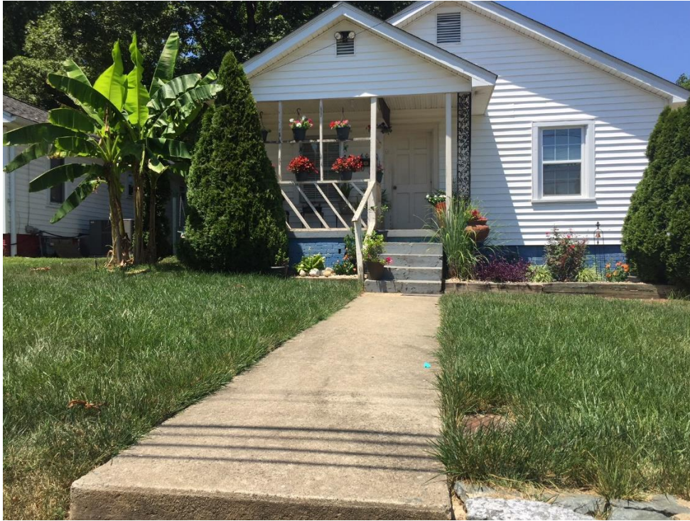
710 N. MAIN ST. GRAHAM, NC 27253 GPIN: 8884072644