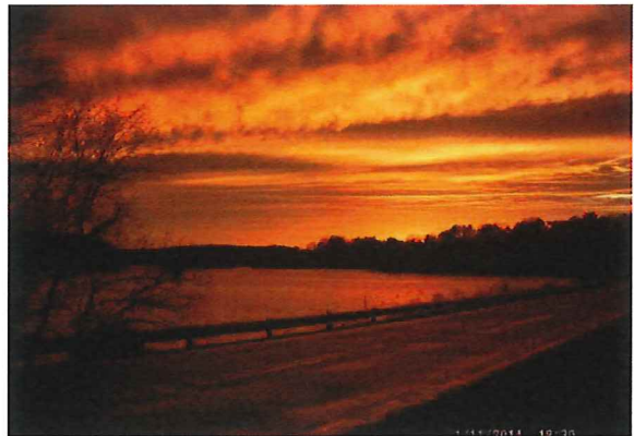
Lake sunset from January 2014.