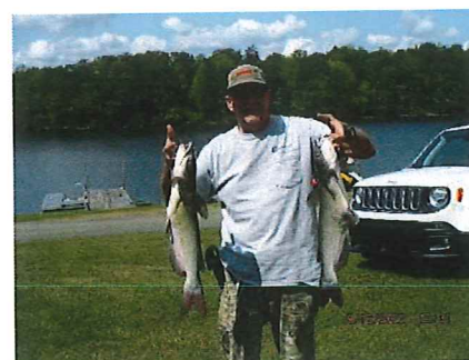
A nice catch of 4-pound Channel Catfish.