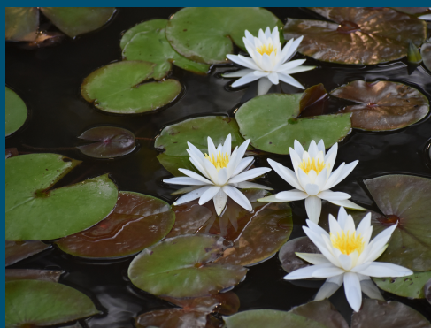
NCWRC Habitat Enhancement Project at Graham-Mebane Lake