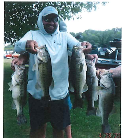
A multifaceted angler with a nice catch.